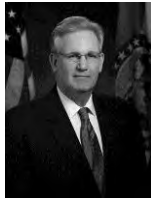
The Honorable Jeremiah W. (Jay) Nixon Governor