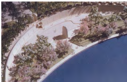
National Memorial Site