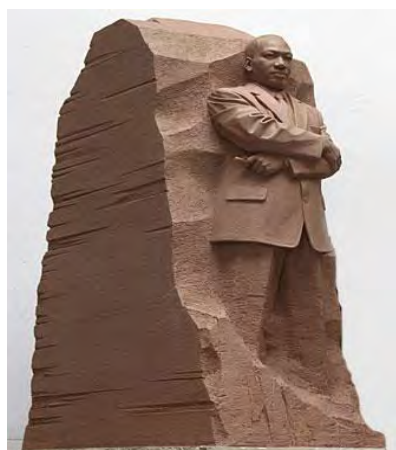
Dr. King Monument