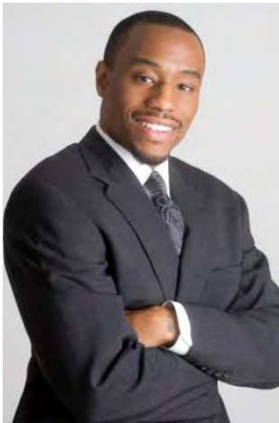
Dr. Marc Lamont Hill