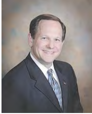
Francis G. Slay Mayor, City of St. Louis