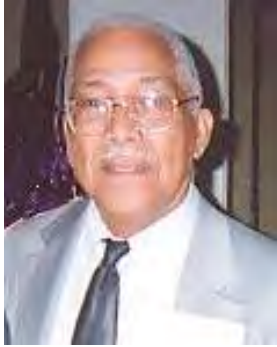
JACK MCBRIDE Commissioner, Fulton